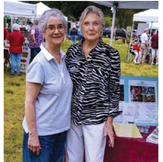
Community Outreach at the Irvington Farmers Market