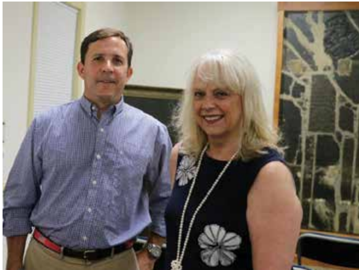
The highlight of the evening was the presentation by renowned curator Bly Straube who led the audience through the discoveries that have made Jamestown one of the richest archaeological sites in the world. Bly's extensive knowledge of Jamestown's material culture was portrayed in slides showing period artworks, primary documents and photographs of Jamestown artifacts.