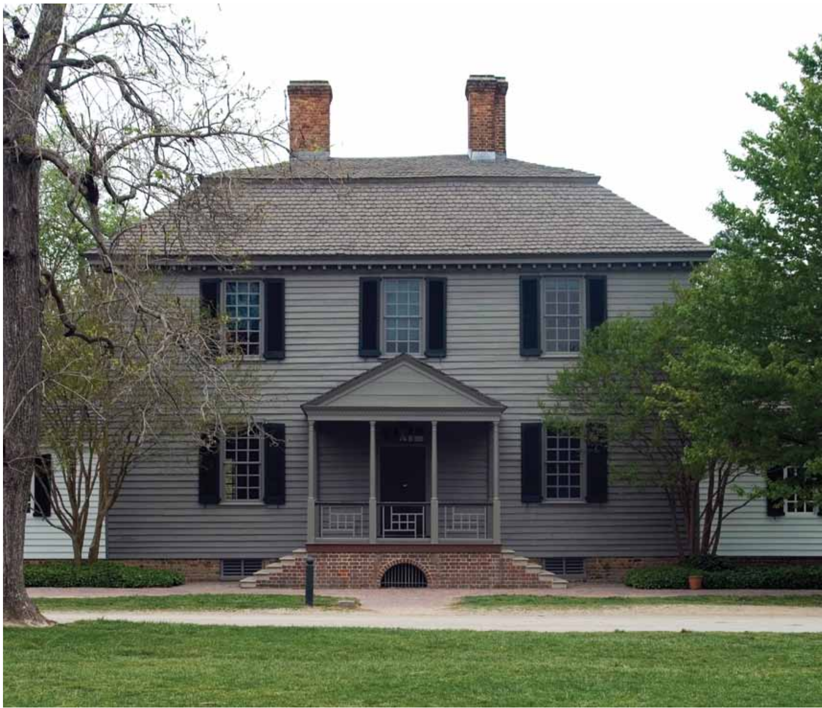
Robert Carter House, Williamsburg